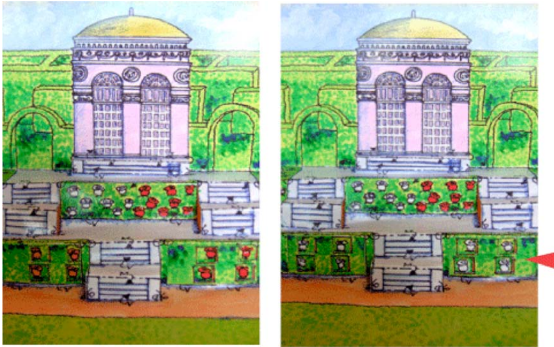
Picture 1. Pull tab (see the red arrow) from left to right and change the colour of the roses!