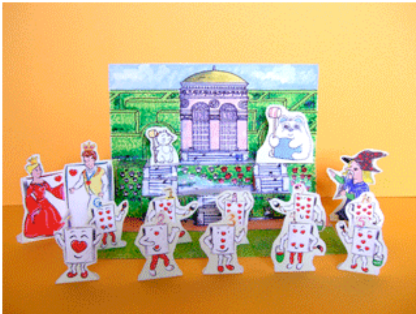
Picture 2. Here's the full cast of characters for this chapter of The Land of Hearts. Enjoy!